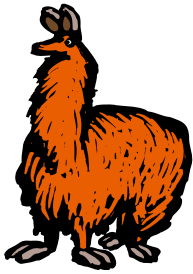
Simon's Rock Llama's